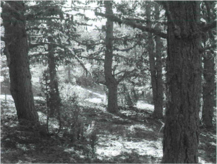
Fig. 11: Type locality of Emmelostiba aragonica sp. n.