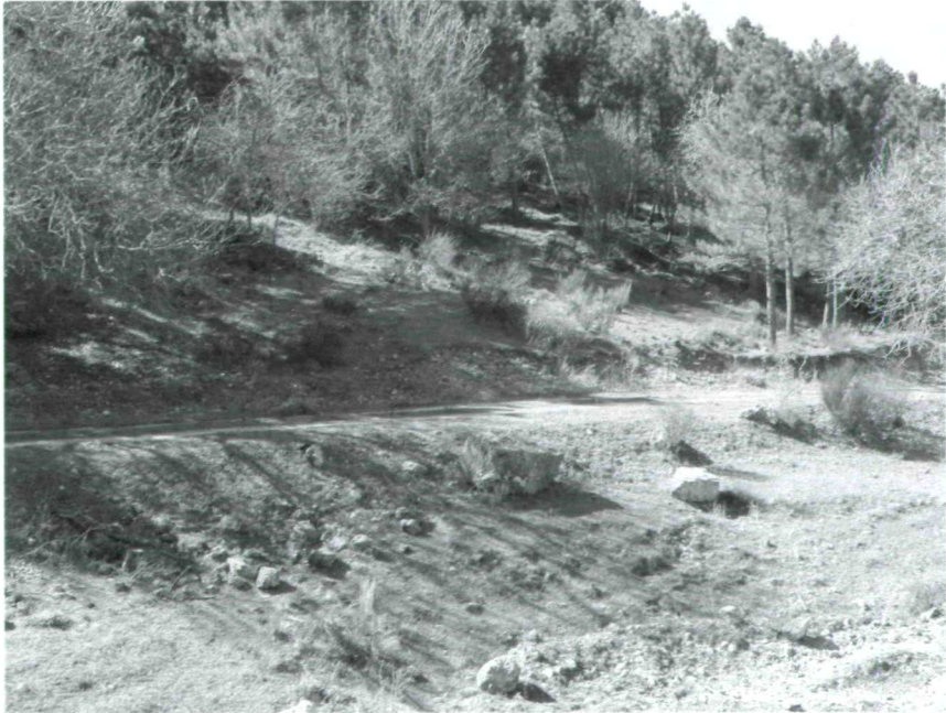
Fig. 14: Type locality of Astenus alcarazae sp. n.